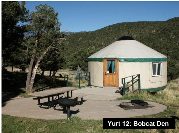
Yurt 12: Bobcat Den