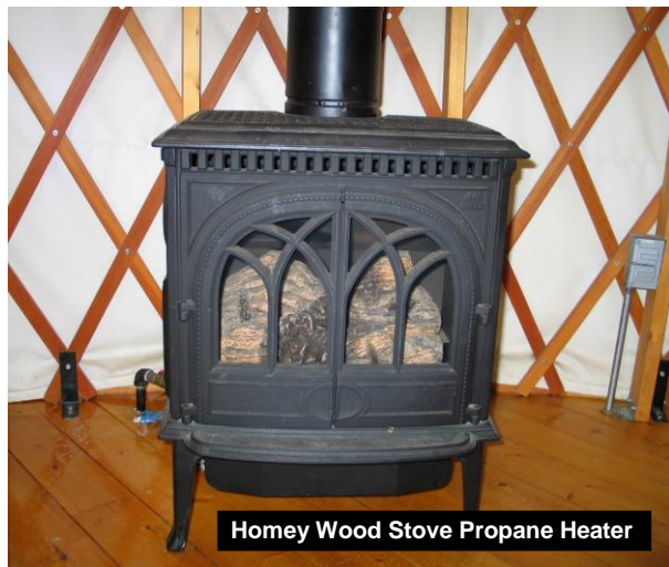
Homey Wood Stove Propane Heater

All-season water hydrants and trash dumpsters are located immediately across from the yurts. The park also provides aluminum recycling bins at the dumpsters. Please do not leave food or trash around your campsite as this may attract animals.