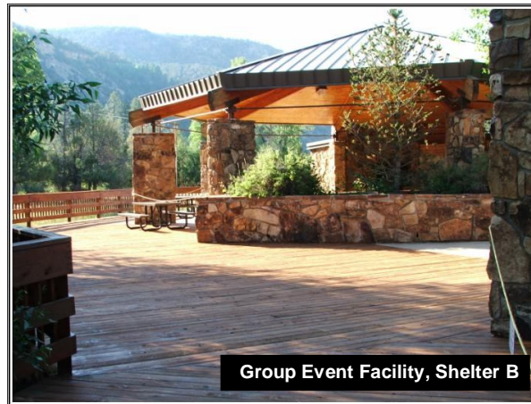
Group Event Facility, Shelter B

Located in the beautiful Pa-Co-Chu-Puk Recreation Site, Ridgway State Park's Group Event Facility provides the perfect setting for reunions, weddings, company picnics and parties of all kinds! The GEF includes: two shade shelters, an open plaza area, redwood deck, charcoal grills, sinks with disposal and flush restrooms. Other site amenities include horseshoe pits, sand volleyball court, lawn and a playground. Play equipment for the horseshoe pits and volleyball court can be checked out by a ranger upon check-in. Total site capacity for all areas is 250 people. The area is open from 9:00 a.m. to 9:00 p.m. Decorations are allowed, but only those fastened with string, plastic ties or clips. Only 3.2% alcohol is allowed. To avoid harm to wildlife, the use of 'silly string', rice, or the releasing of any animals or insects is prohibited.