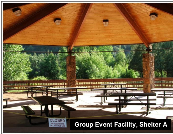
Group Event Facility, Shelter A

The Conference Room is an ideal location for groups of up to 40 people to hold meetings, seminars and training programs. The park can provide your group with chairs, folding tables and audio-visual equipment (VHS player, digital projector, slide projector, whiteboard, flipchart). We also provide kitchen facilities (sink, fridge, coffee machine and microwave) for coffee breaks and snacks at no charge unless a meal is served.