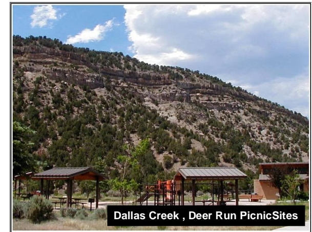
Dallas Creek, Deer Run Picnic Sites

Additional small group eating sites not requiring reservations are available at Dallas Creek. You may bring picnic tables or portable shelters, but notify the Park Office if you plan to do so.