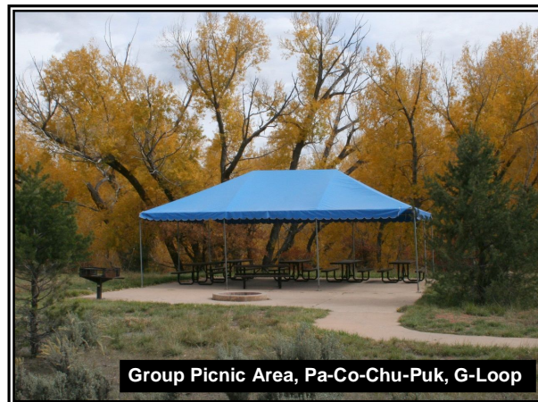
Group Picnic Area, Pa-Co-Chu-Puk, G-Loop

This lovely site on the north end of G-Loop includes: shade shelter, concrete pad, fire ring, barbecue grill, 6 picnic tables and yard hydrant. The capacity for the site is 75 people.