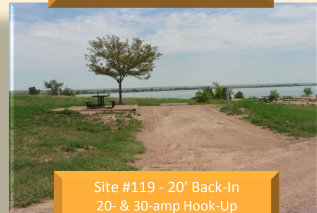
Site #119 - 20' Back-In 20- & 30-amp Hook-Up No Shade