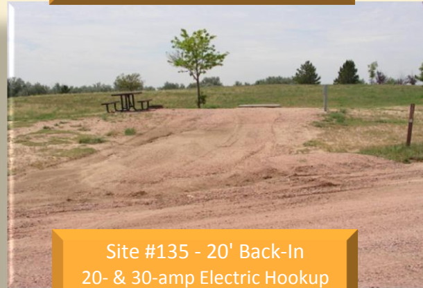
Site #135 - 20' Back-In 20- & 30-amp Electric Hookup No Shade