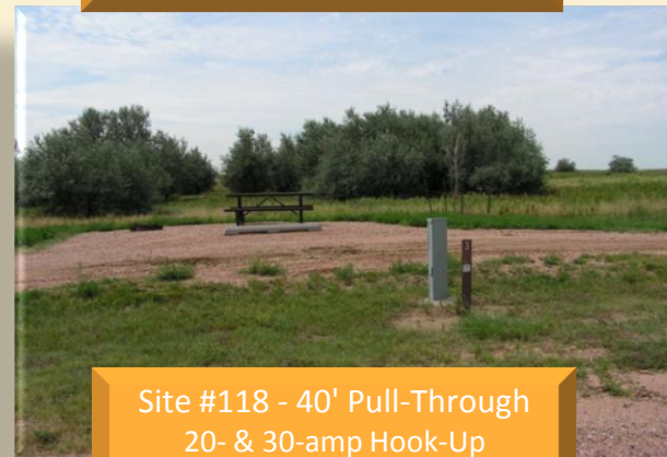
Site #118 - 40' Pull-Through 20- & 30-amp Hook-Up No Shade