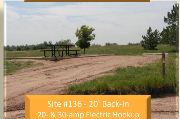
Site #136 - 20' Back-In 20- & 30-amp Electric Hookup No Shade