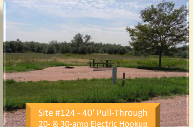
Site #124 - 40' Pull-Through 20- & 30-amp Electric Hookup Some Shade