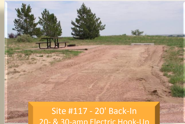
Site #117 - 20' Back-In 20- & 30-amp Electric Hook-Up No Shade