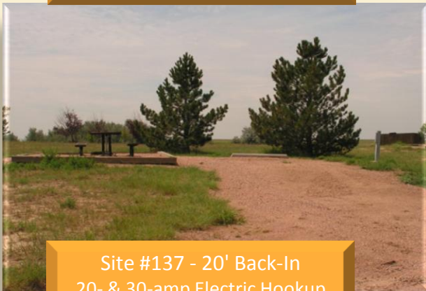
Site #137 - 20' Back-In 20- & 30-amp Electric Hookup No Shade