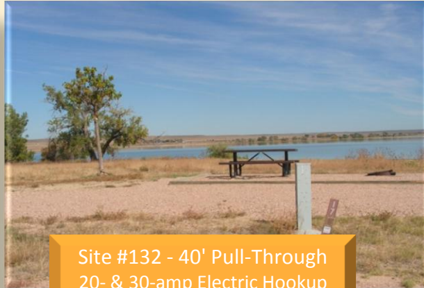
Site #132 - 40' Pull-Through 20- & 30-amp Electric Hookup No Shade