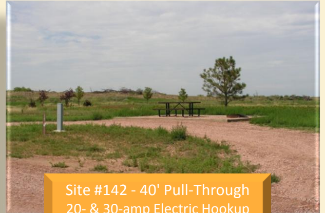
Site #142 - 40' Pull-Through 20- & 30-amp Electric Hookup No Shade

NOTE: Campsite Markers in pictures may not be consistent with assigned number. This is due to renumbering of campsites. Numbers referenced with pictures are correct.