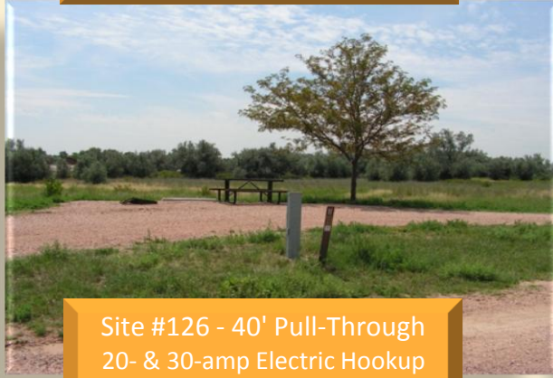
Site #126 - 40' Pull-Through 20- & 30-amp Electric Hookup Some P.M. Shade