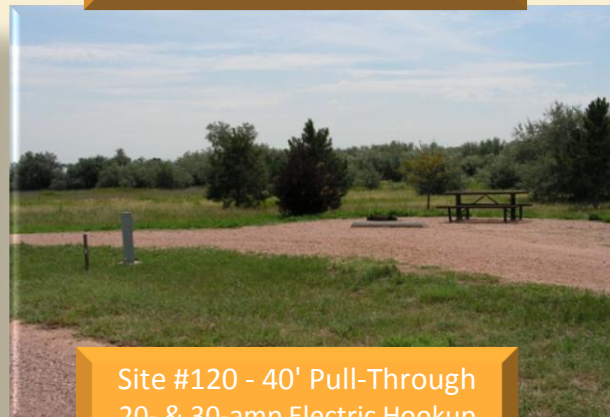
Site #120 - 40' Pull-Through 20- & 30-amp Electric Hookup No Shade