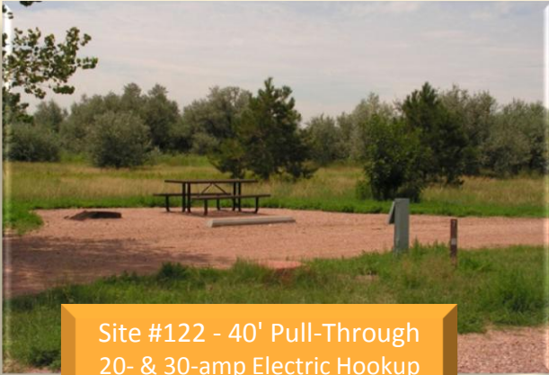
Site #122 - 40' Pull-Through 20- & 30-amp Electric Hookup Some Shade