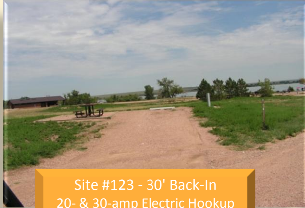
Site #123 - 30' Back-In 20- & 30-amp Electric Hookup No Shade