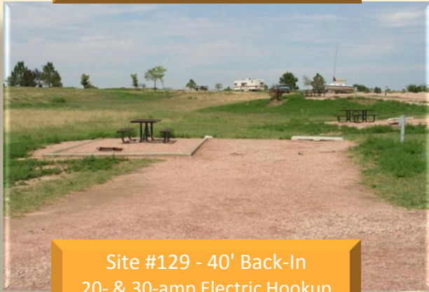
Site #129 - 40' Back-In 20- & 30-amp Electric Hookup No Shade