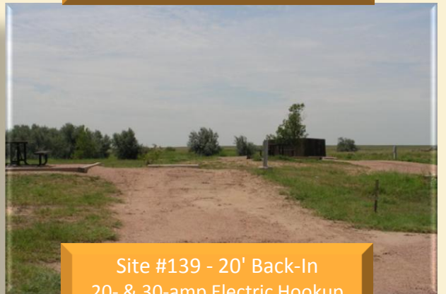
Site #139 - 20' Back-In 20- & 30-amp Electric Hookup No Shade