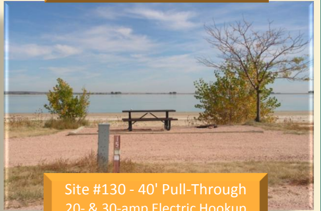
Site #130 - 40' Pull-Through 20- & 30-amp Electric Hookup No Shade