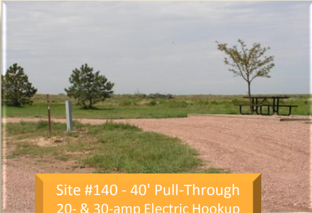
Site #140 - 40' Pull-Through 20- & 30-amp Electric Hookup No Shade