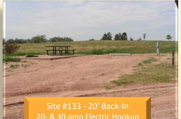
Site #133 - 20' Back-In 20- & 30-amp Electric Hookup No Shade