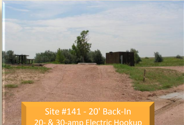
Site #141 - 20' Back-In 20- & 30-amp Electric Hookup No Shade