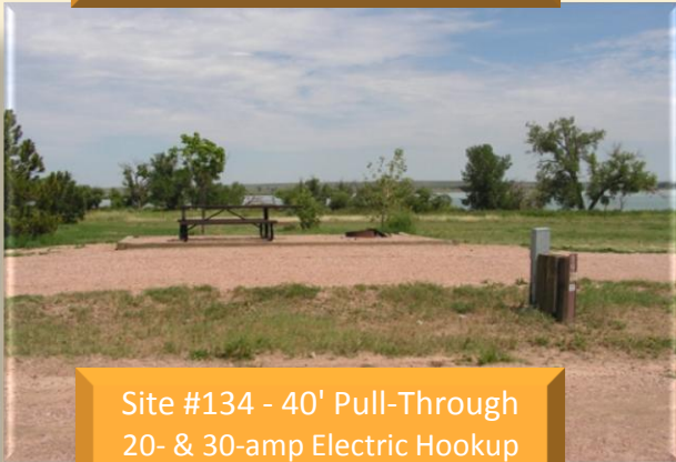
Site #134 - 40' Pull-Through 20- & 30-amp Electric Hookup No Shade