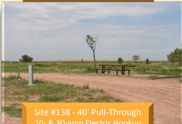
Site #138 - 40' Pull-Through 20- & 30-amp Electric Hookup No Shade