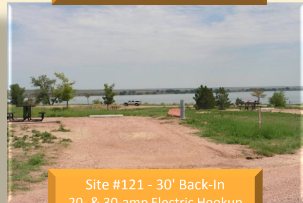
Site #121 - 30' Back-In 20- & 30-amp Electric Hookup No Shade