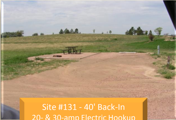
Site #131 - 40' Back-In 20- & 30-amp Electric Hookup No Shade