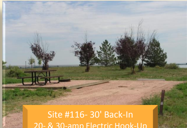
Site #116 - 30' Back-In 20- & 30-amp Electric Hook-Up No Shade