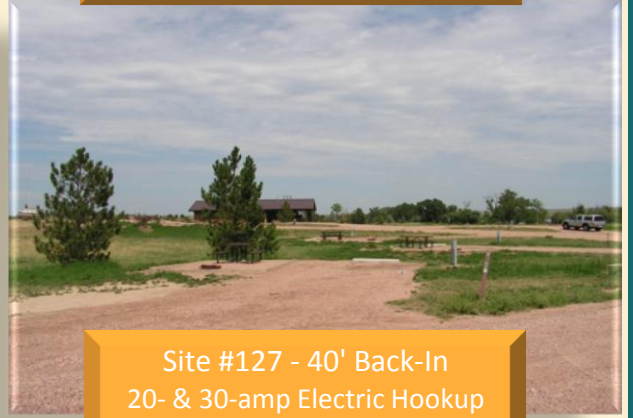
Site #127 - 40' Back-In 20- & 30-amp Electric Hookup No Shade