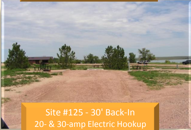
Site #125 - 30' Back-In 20- & 30-amp Electric Hookup No Shade