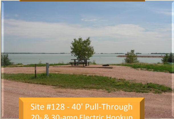
Site #128 - 40' Pull-Through 20- & 30-amp Electric Hookup No Shade