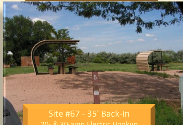
Site #67 - 35' Back-In 20- & 30-amp Electric Hookup Man-Made Shade - Some PM Shade