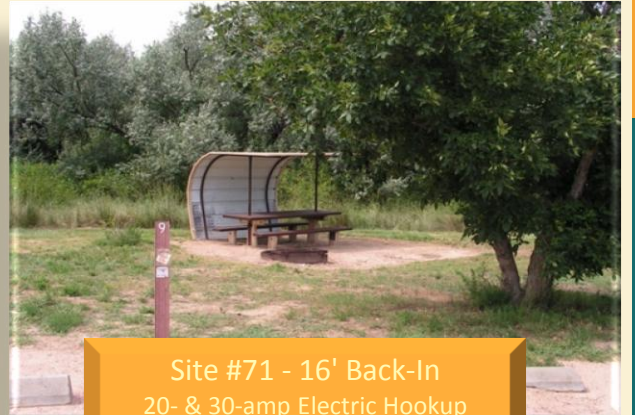
Site #71 - 16' Back-In 20- & 30-amp Electric Hookup Man-Made Shade - Some Shade Not suitable for long RVs/5th wheels but suitable for tent-trailers or tents