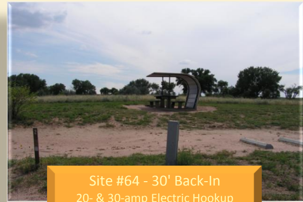
Site #64 - 30' Back-In 20- & 30-amp Electric Hookup Man-Made Shade