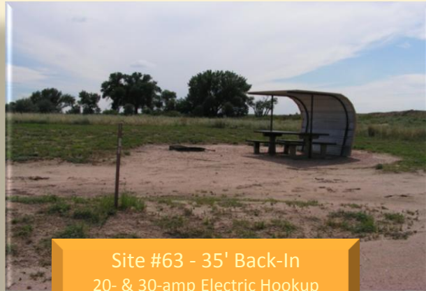
Site #63 - 35' Back-In 20- & 30-amp Electric Hookup Man-Made Shade