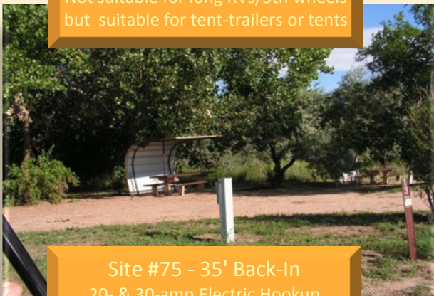
Site #75 - 35' Back-In 20- & 30-amp Electric Hookup Man-Made Shade - Some Shade