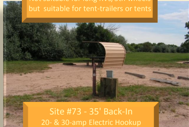
Site #73 - 35' Back-In 20- & 30-amp Electric Hookup Man-Made Shade