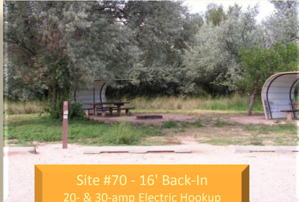
Site #70 - 16' Back-In 20- & 30-amp Electric Hookup Man-Made Shade - Some Shade Not suitable for long RVs/5th wheels but suitable for tent-trailers or tents