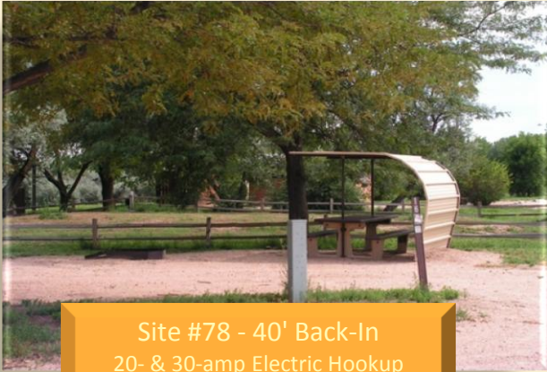
Site #78 - 40' Back-In 20- & 30-amp Electric Hookup 10' Height Restriction Man-Made Shade - Some Shade

NOTE: Campsite Markers in pictures may not be consistent with assigned number. This is due to renumbering of campsites. Numbers referenced with pictures are correct.