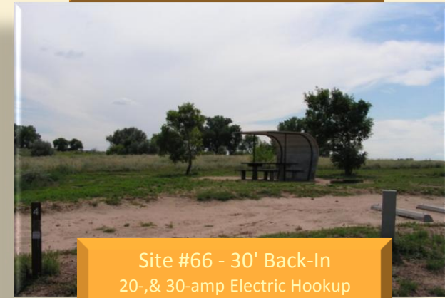
Site #66 - 30' Back-In 20- & 30-amp Electric Hookup Man-Made Shade