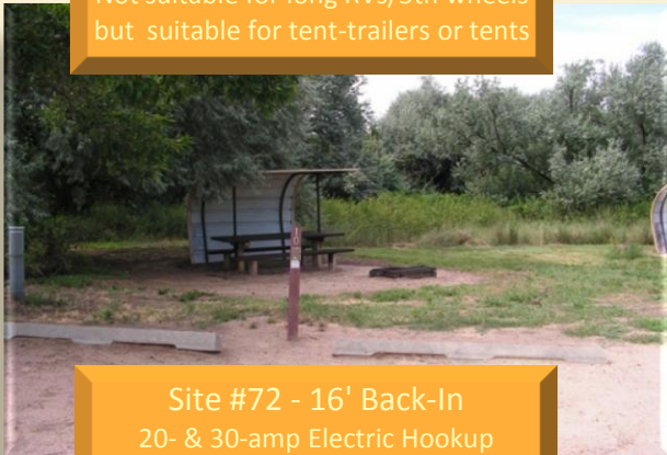
Site #72 - 16' Back-In 20- & 30-amp Electric Hookup Man-Made Shade - Some Shade Not suitable for long RVs/5th wheels but suitable for tent-trailers or tents