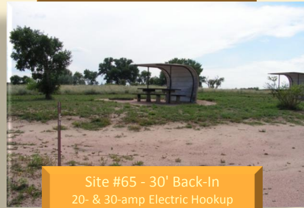
Site #65 - 30' Back-In 20- & 30-amp Electric Hookup Man-Made Shade