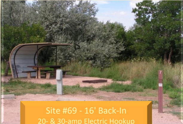
Site #69 - 16' Back-In 20- & 30-amp Electric Hookup Man-Made Shade - Some Shade Not suitable for long RVs/5th wheels but suitable for tent-trailers or tents