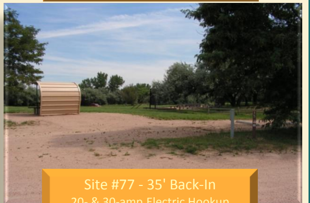
Site #77 - 35' Back-In 20- & 30-amp Electric Hookup Man-Made Shade - Some PM Shade