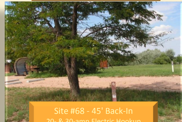
Site #68 - 45' Back-In 20- & 30-amp Electric Hookup Man-Made Shade